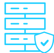
Actionable Roadmap for Security Improvements