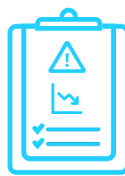
Measurable Risk Reduction